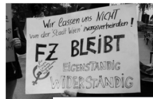
Protestaktion des FZ bei einem Besuch des „Punschstandes“ der Stadträtin Gaál Dez.19

We do not need fewer but MORE autonomous women's spaces and feminist structures of resistance.