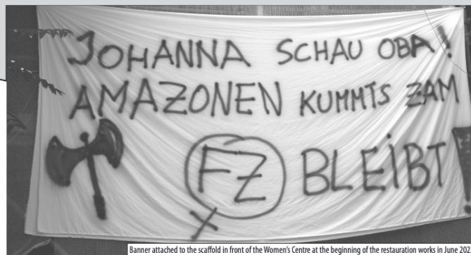
Banner attached to the scaffold in front of the Women's Centre at the beginning of the restoration works in June 2022

Herstory: In 1981 the unused building of the Industrial Technology Museum (TGM) which was owned by the state and was destined for demolition was "acquired" by both the Association for a Women's Centre and by WUK. It was the women who "got hold of" the key and who were the first to enter the building. Since then, the building complex at Währingerstraße 59 in Vienna has been used by the Women's Centre (staircase 6) and the WUK (staircases 1-5). In all those years there had been between the Women's Centre and the WUK an exchange on the basis of solidarity and agreements on the use of the building. But again and again, controversial opinions and conflicts had a negative impact on the relationship with the board of WUK especially with regard to questions concerning neces-