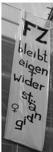
Transparent am Baugerüst vom FZ zu Beginn der Sanierungsarbeiten Juni 2022

Contrary to the facts, the rental contract between WUK and the Vienna City Council states that WUK in 1981 occupied the entire building and has been using it since then?! This fails to do justice to the facts! The Women's Centre has never been part of WUK and WUK has never held the entire building. Both the Vienna City Council and WUK are familiar with this fact. One "occupant" is not permitted to conclude a rental contract for another autonomous, unaffiliated "occupant". More than that, by means of incorrect information regarding legally relevant points in the rental contract, a third party not directly involved must not be included in the contract. Therefore, the WUK association cannot act as the "lender" of the staircase 6 part of the building to the Women's Centre.